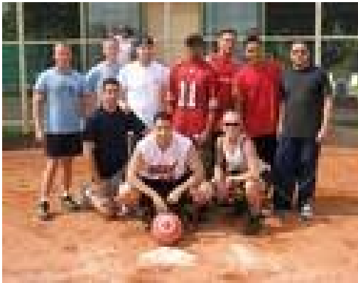
2007 Kickball Championship Team, IMOC

Over 50 participants converged on Husky field to relive their childhood playground days by participating in Stuttgart's first 8-on-8 Kick Ball Tournament. Teams representing K-9, Special Staff, EMSS, IMOC, EU-COM J2, 52 nd Signal, and EU-COM J5 took part in the tournament. The warm sunny weather made it a great day for spectators and players, with laughter and the distinctive sound of the red ball being kicked echoing throughout the day. Every "pitcher" and kicker had their own unique style of delivering and kicking the ball. The tournament lasted approximately 5 ½ hours with IMOC defeating EU-COM J2 by a close score of 1-0. Congratulations to all teams for coming out for some fun and fitness!